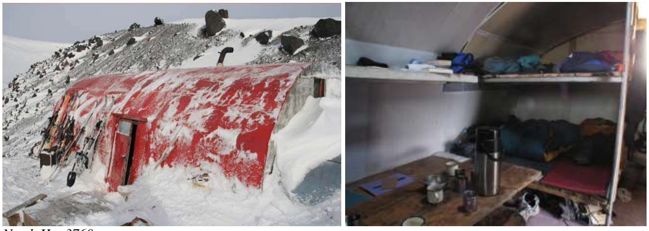
North Hut 3760m